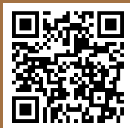
TABLE COSTS ARE BY DONATION

SATURDAY JULY 3RD SATURDAY JULY 17TH SATURDAY JULY 31ST SATURDAY AUGUST 14TH SATURDAY AUGUST 28TH SATURDAY SEPTEMBER 11TH